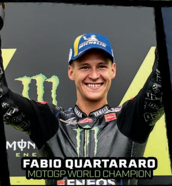
FABIO QUARTARARO MOTOGP WORLD CHAMPION