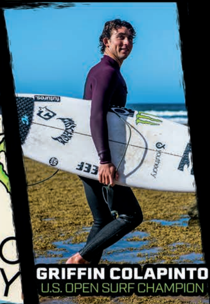
GRIFFIN COLAPINTO U.S. OPEN SURF CHAMPION