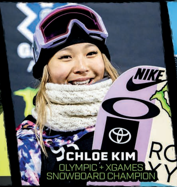
CHLOE KIM OLYMPIC + XGAMES SNOWBOARD CHAMPION